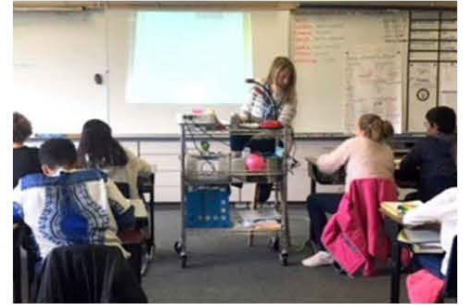
MICHELL GYM LATE JUNE 2020