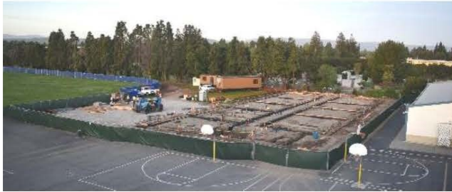
EAST AVE. JUNE 2020